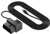
FOCUWAY OBD CABLE (included in the box)