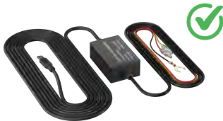
FOCUWAY HARDWIRE KIT (not included)

DON'T use the car charger, USB C cable or the OBD cable which not from us, otherwise this cam CAN'T work!